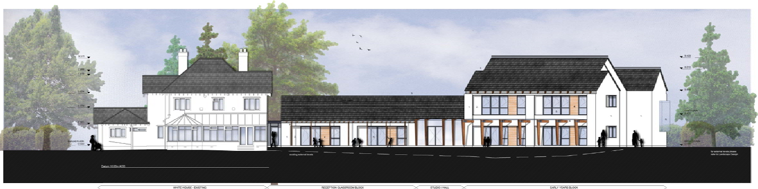
3 Elevation 3 1:100

NOTE: To be read in conjunction with landscape design GENERAL NOTES Copyright of this drawing is vested in the Architect and it must not be copied or reproduced without consent. Only figured dimensions are to be taken from this drawing. All contractors must visit the site and be responsible for taking and checking all dimensions relative to this work. Notify the Architect immediately of any variation between drawings and site conditions. This drawing is based on survey information supplied from CGL Survey Group Ltd.