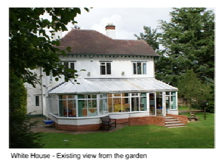
White House - Existing view from the garden